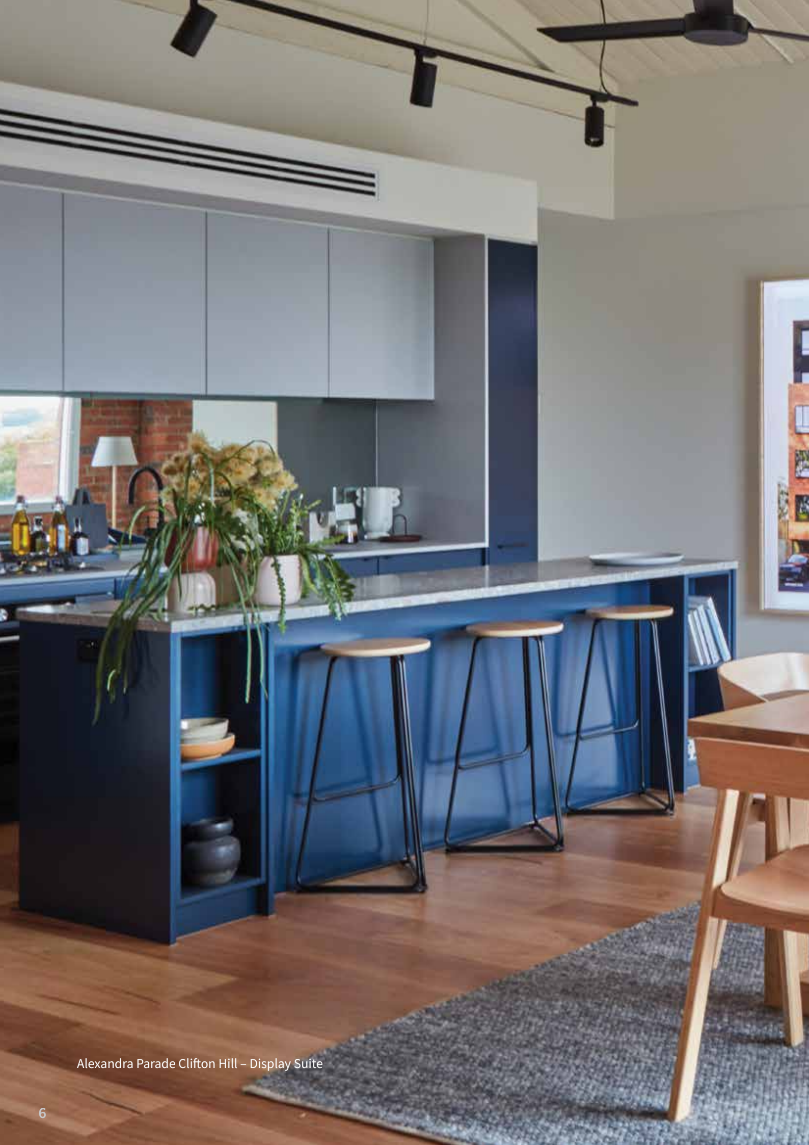
Alexandra Parade Clifton Hill – Display Suite