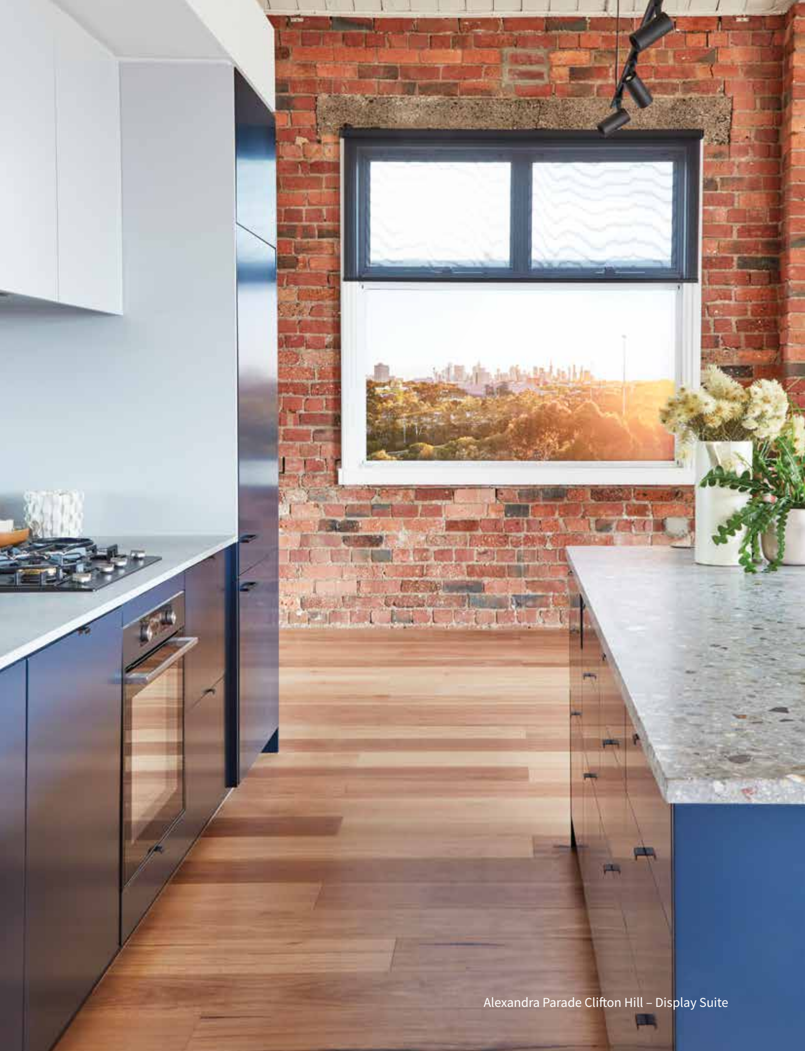
Alexandra Parade Clifton Hill – Display Suite